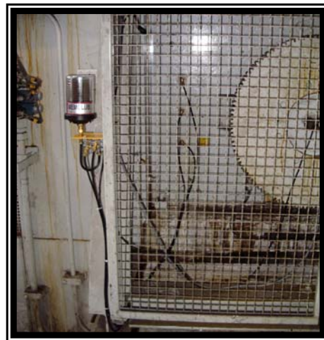
Multi-Point system with a reusable MEMOLUB lubricator.

Lube points which are normally difficult to access can be serviced quickly and efficiently with a MEMOLUB system.