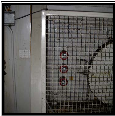
“Single-use” lubricators servicing orientation gear.