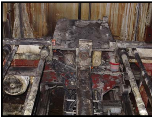
“Single-use” lubricators servicing pump bearings.

Solution : All single-use, electrochemical lubricators were replaced with two 3-Point lubrication systems. For the orientation gear, the lubrication system was remote-mounted outside the cage for easy access, which not only made visual inspection of the lubricator easier, but also allowed for quick lube cartridge changeouts without shutting down the washer.